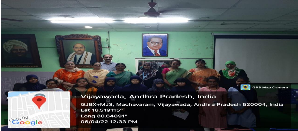
SRR College Radio team and students in Mini Conference Hall